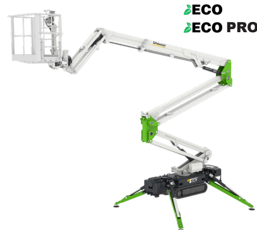
ECO ECO PRO