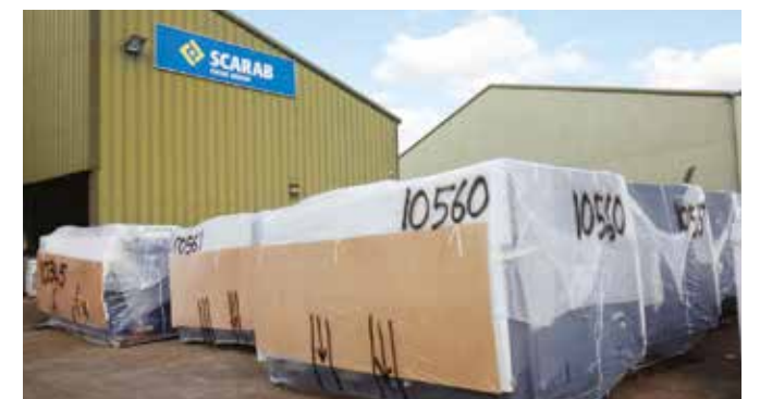
Export skid unit packaged and ready to ship

Thanks to our comprehensive network of trusted dealers worldwide, our export skid units can be distributed to even the most remote locations. Our dealer network is a collection of specially selected sweeping experts, each equipped with dedicated Scarab knowledge and access to our innovative products to help clients meet the demands of their operations. Spread across six continents, our network is continuing to grow as we look to offer our technical and commercial innovations to as many countries as possible.